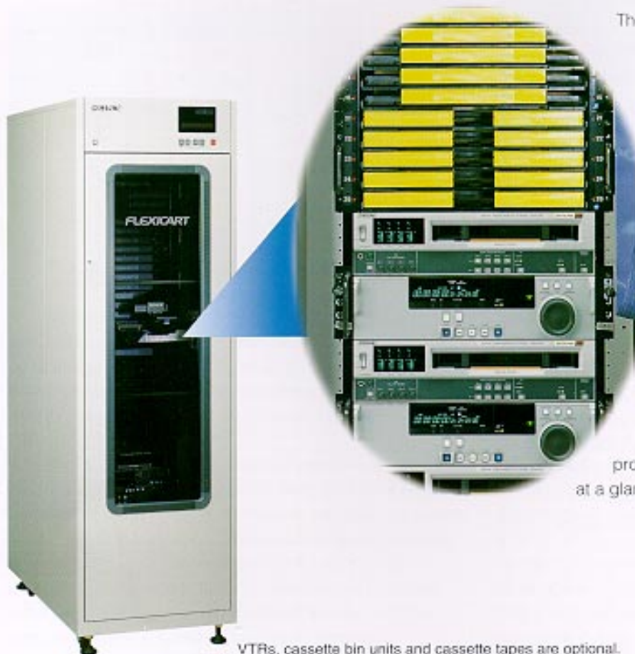
VTRs, cassette bin units and cassette tapes are optional.

The BKFC-8D and BKFC-10B allow users to maximize tape storage irrespective of cassette size, the BKFC-8D accepting large, medium and small D-2 cassette tapes and the BKFC-10B holding both large and small Digital BETACAM, Betacam SX or Betacam SP cassettes.